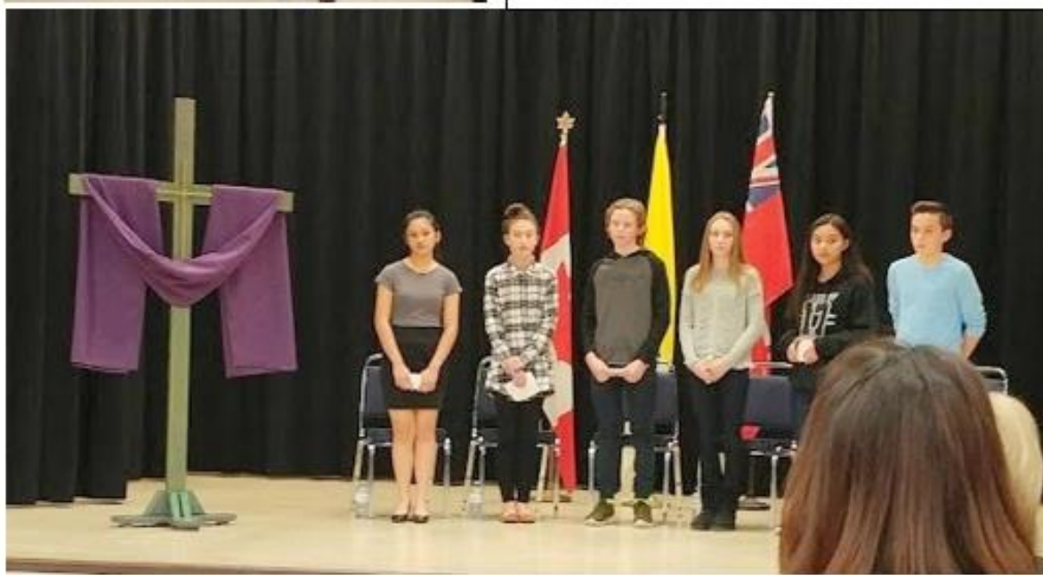
The six contestants and the “Sam Cervoni” cross prominently displayed on center stage